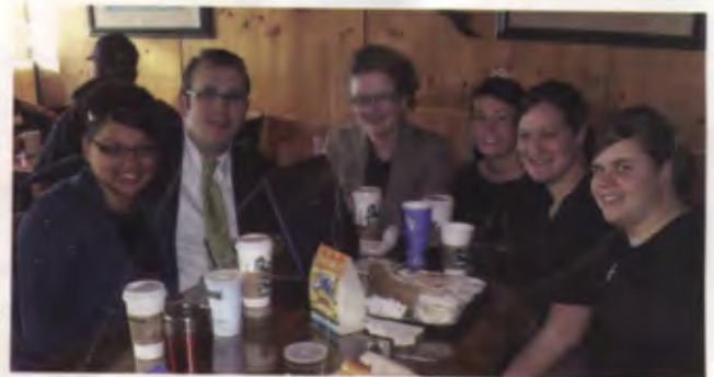
Students enjoy fellowship at nearby coffee shop