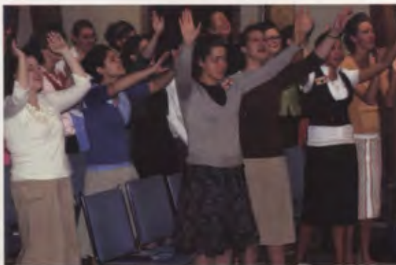
Prospects and students worshipping in chapel service