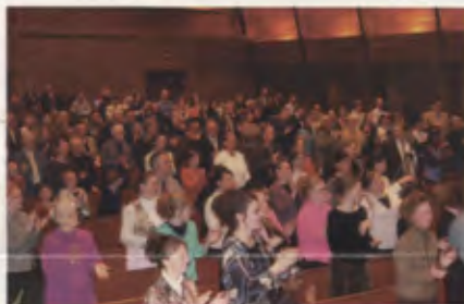
Part of congregation at concert