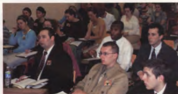
Prospective students in class with freshmen