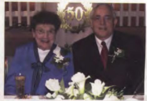
Grants celebrate 50th Wedding Anniversary