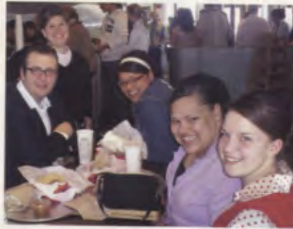
Students help coach Bible Quizzing teams of First UPC, our church home.