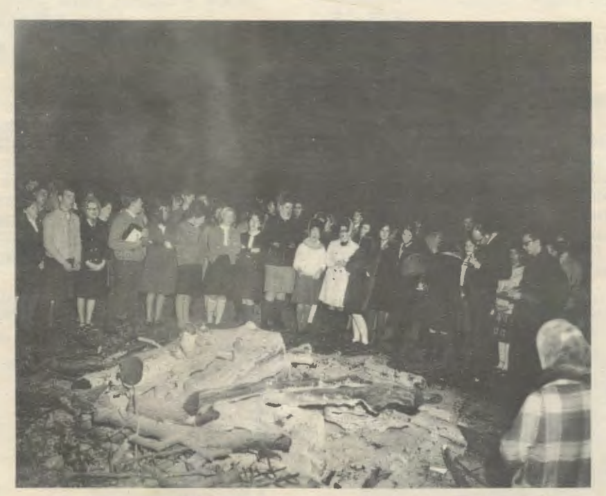
A.B.I. Students singing at Fireside Consecration Service