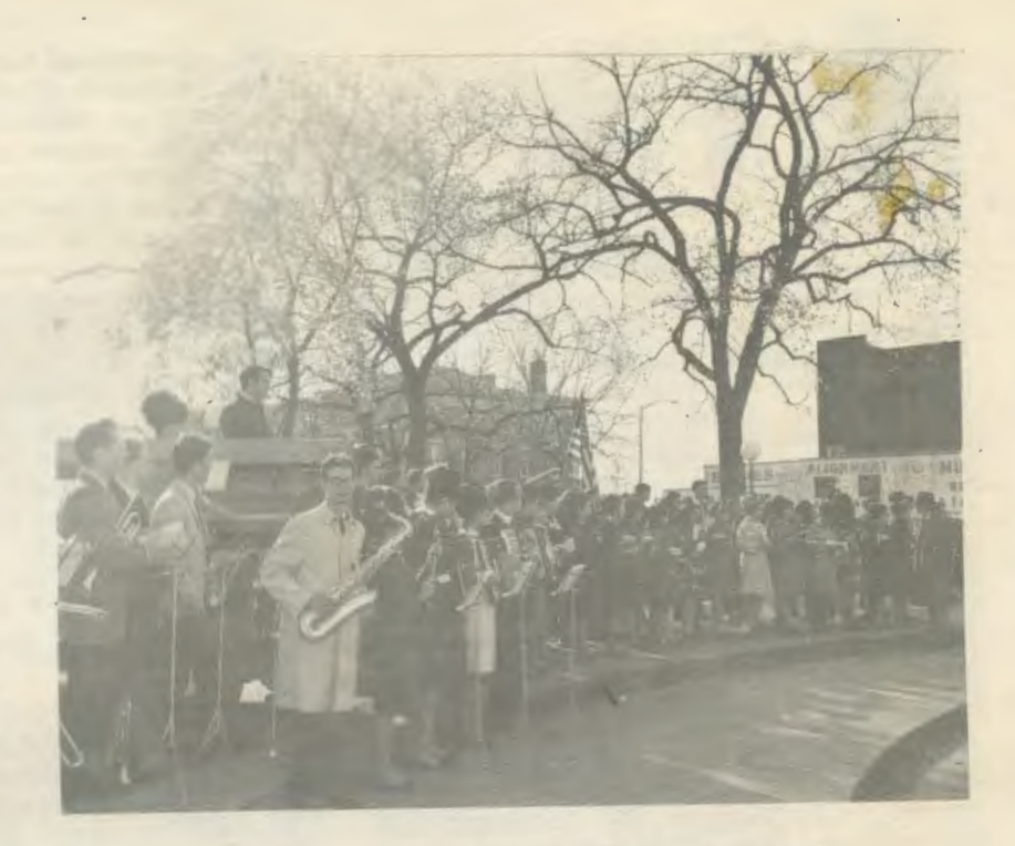
Marchers gathered in a park to sing and play Gospel and patriotic songs.