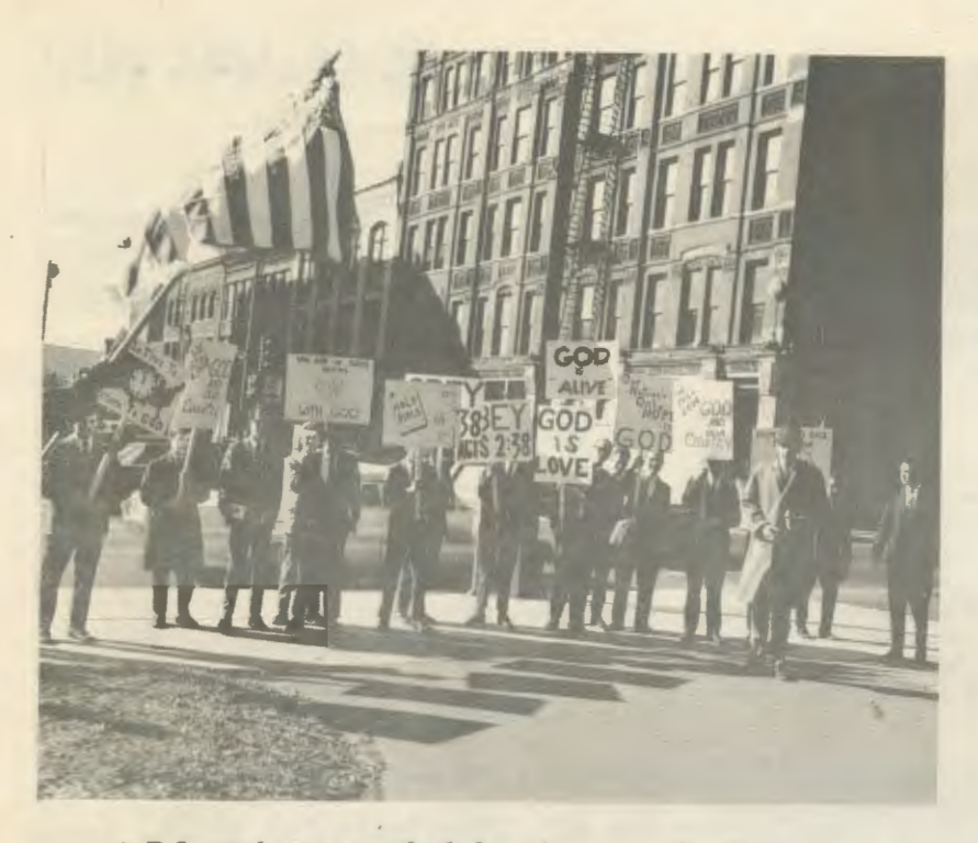
A.B.I. students marched thru downtown St. Paul with banners and Bibles proclaiming their love for God and country.