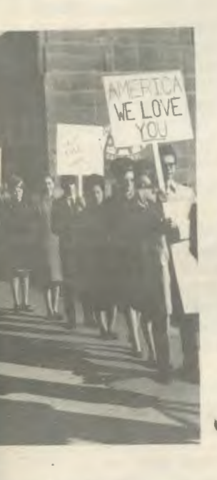
ributed to St. Paulites narch.