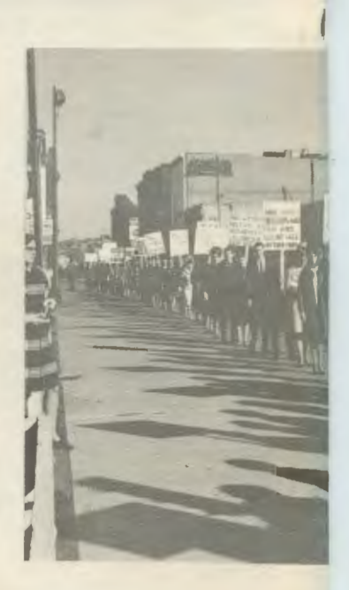
Hundreds of tracts were di by A.B.I.students during th