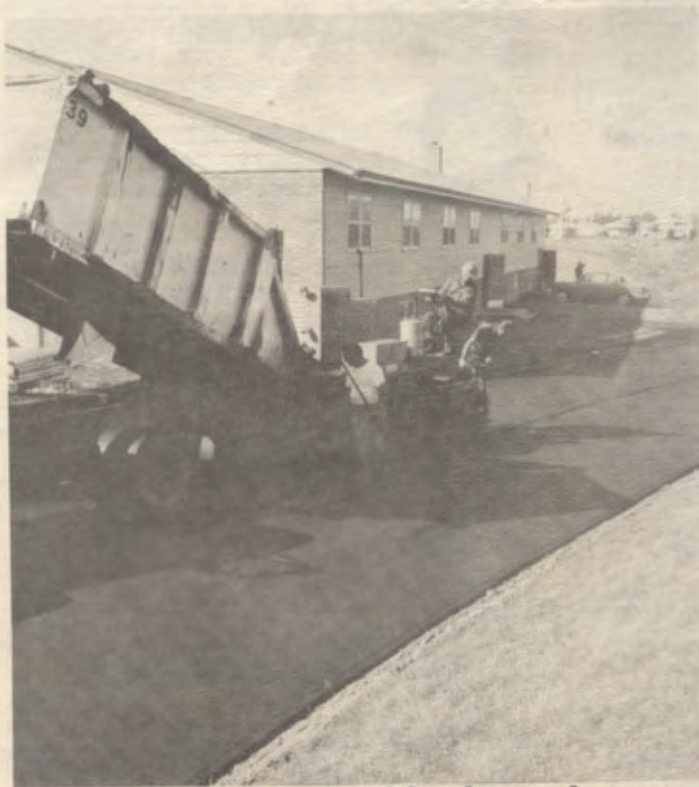
School gets blacktopping