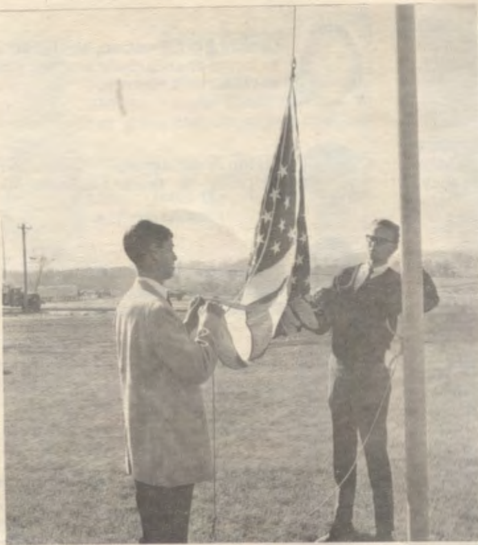
Flagpole erected on campus