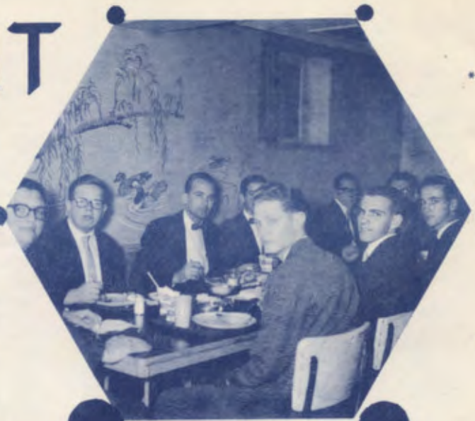
A.B.I. boys in school dining hall.