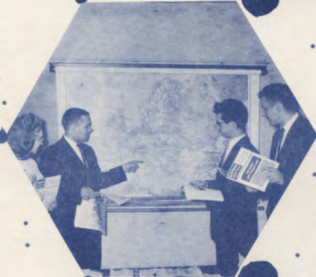
Seniors study world happenings in Current Events class.