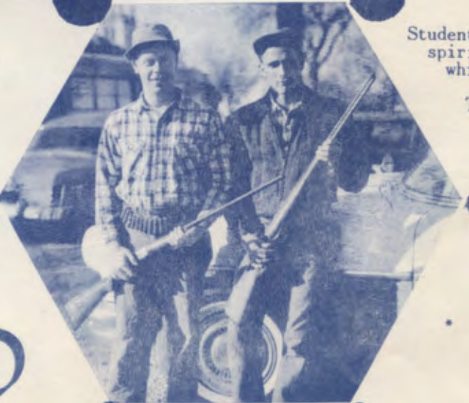
Students re spiritual while at Mid Tabern