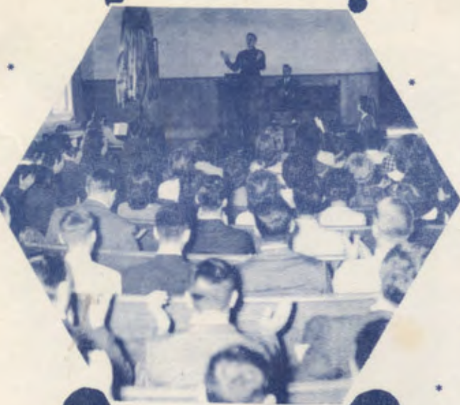
A typical A.B.I. devotion.