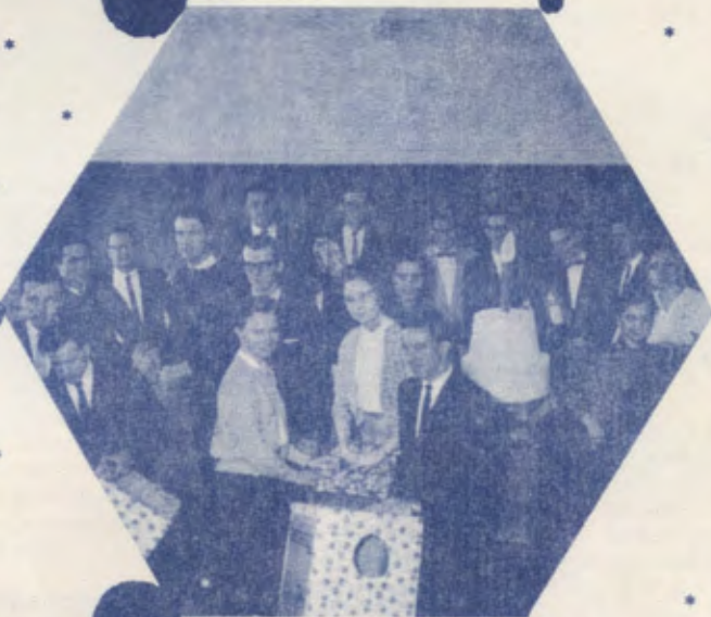
Students prepare for an Audio Visual Aid Demonstration.