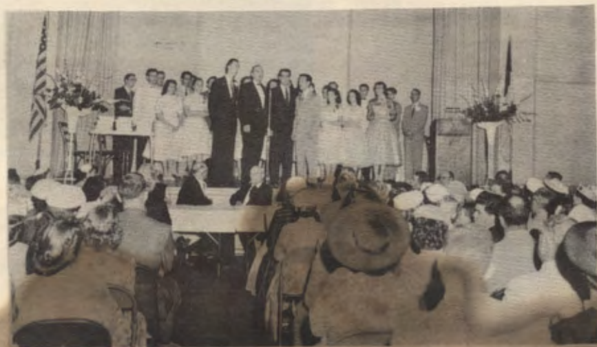
Male Quartet and A.E.I. Chorus singing at banquet.