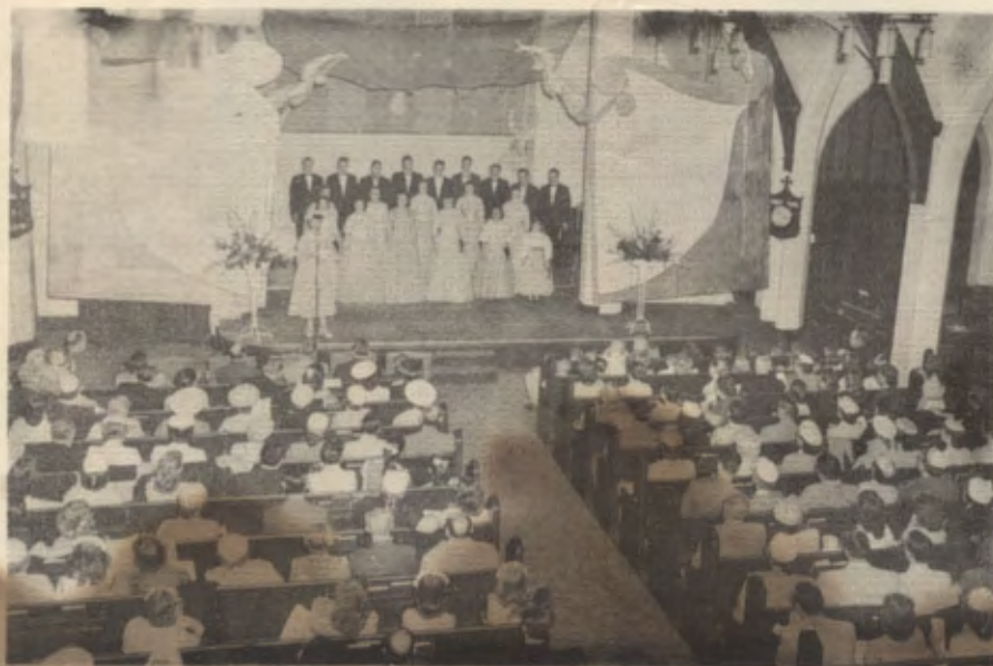
Choral reading group and part of congregation.