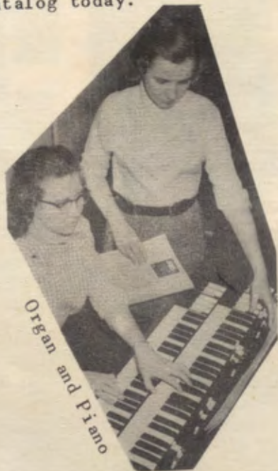
Organ and Piano