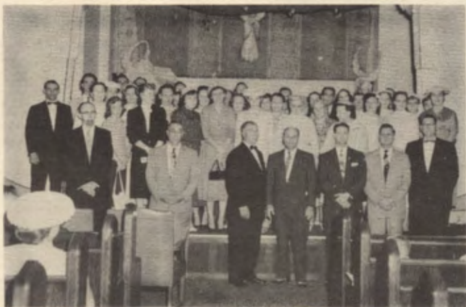
Look how Illinois was represented at the graduation.