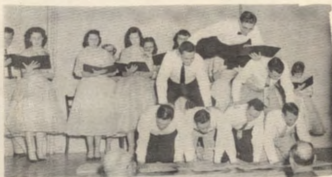
Urtle the Turtle, Choral Reading