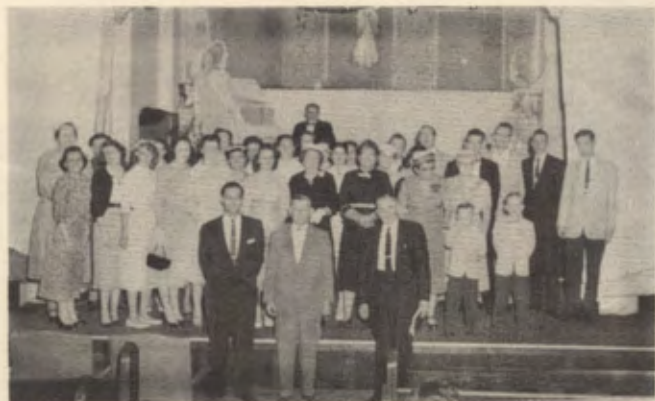
Here is the Buckeye State, Ohio represented at graduation!