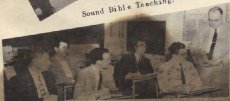
Sound Bible Teaching!