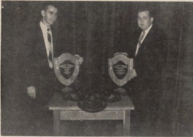
General Conquerors' Officers with Plaques