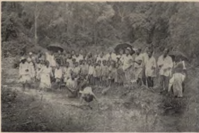
Baptizing in Jesus' name in the Manipur Hills