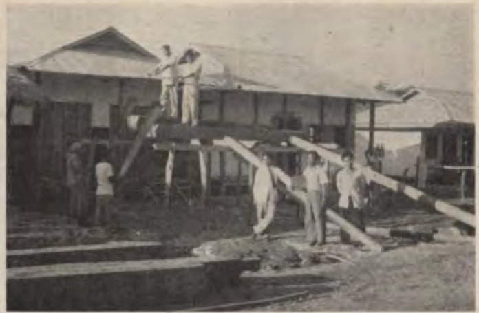
Sawing lumber for a church in the Manipur Hills