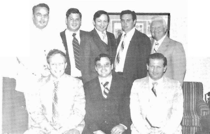
THE KENTUCKY DISTRICT QUEST TEAM

GEAR YOUR THINKING NOW TOWARD THE QUEST FOR THE APOSTOLIC KEY.