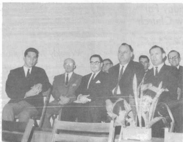
Group of Ministers at Fall Conference at Raceland, Ky.

The fundamental Doctrine of the United Pentecostal Church is Repentance, Baptism in Jesus Name, and the infilling of the Holy Ghost according to Acts 2:38.