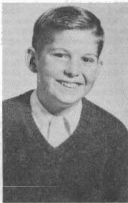
Poem To Be Published