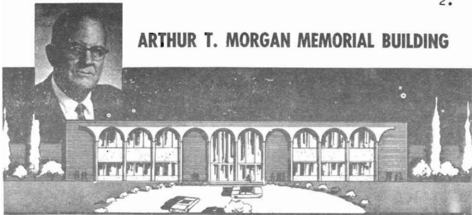
Artist's drawing of the new International Headquarters Office of the United Pentecostal Church, which will be built in St. Louis, Missouri.

The General Board of the United Pentecostal Church takes this opportunity to inform our Pentecostal fellowship of the action taken while in session at General Conference, Tulsa, Oklahoma. Our proposed and much-needed new headquarter's office has been designated as the ARTHUR T. MORGAN MEMORIAL BUILDING. This is a most fitting expression of devotion to a man who led us to this juncture of growth. We now extend an invitation to our people to make this building a rapid reality. Please note the following schedule of anticipated plans for the construction of this memorial building.